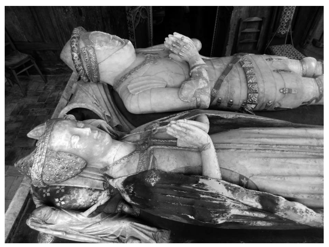
FIG. 180 – Painted and gilded alabaster monument to Sir William Phelip, KG, styled Lord Bardolf (d. 1441) and his wife Joan Bardolf (d. 1447) in St Margaret's Chapel in Dennington church.