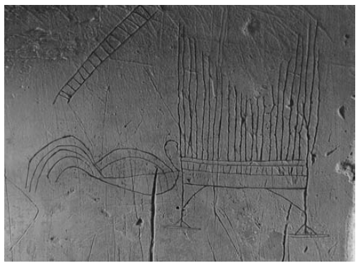
ABOVE FIG. 183 – A larger fixed church organ with 22 pipes and keys. N column, panel facing W.