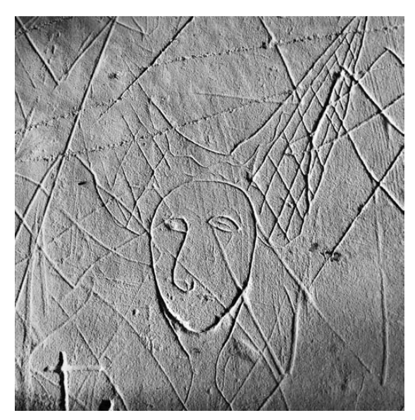
FIG. 184 – A lady wearing a 15th-century horned headdress. S column, panel facing W.

Members were encouraged to examine the drawings with torches and discuss them.