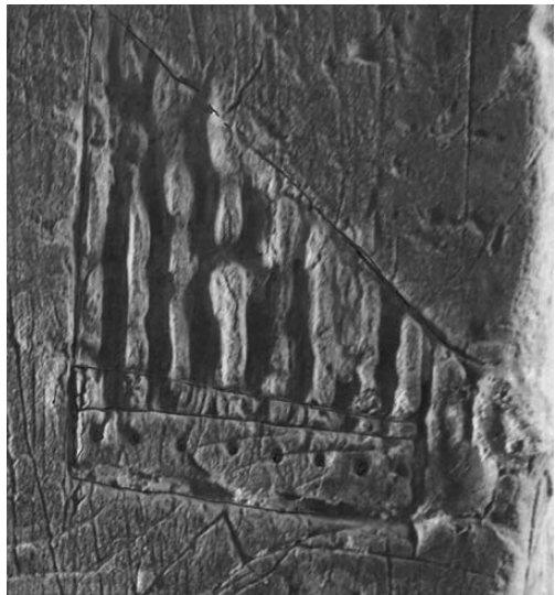
FIG. 182 – A portative (?) organ with keyboard and triangular pipe field. N column, panel facing W.